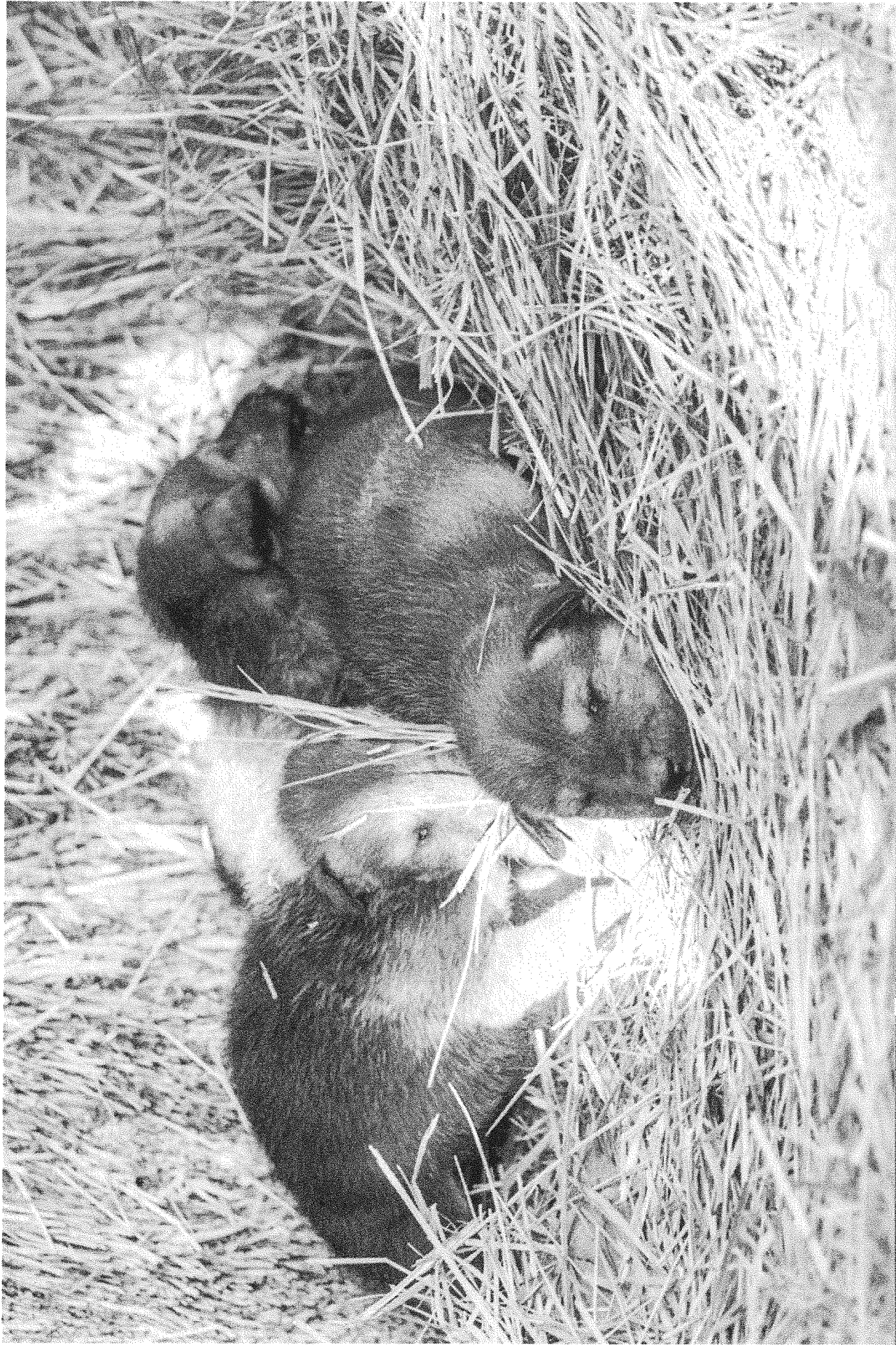
Red wolf pups