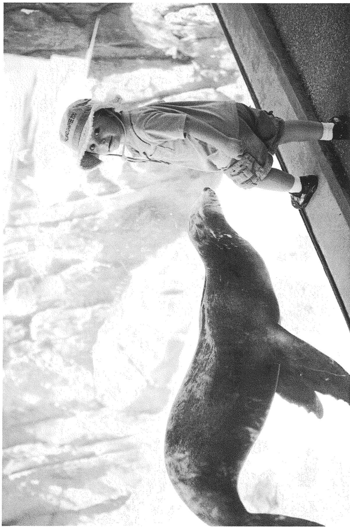
Fresno Chaffee Zoo